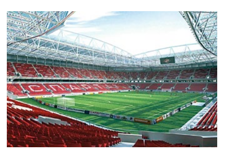
Belden Prepares Spartak's New Stadium to Broadcast 2018 World Cup

Like all our products, Belden Professional Video Cables are designed and manufactured to strict quality standards, ensuring consistently high performance that is true to specification. And while some only spot check, Belden tests every meter of cable as it is produced. To ensure best-in-class performance, each and every spool of Belden's Professional Video Cable is 100% sweep tested before it leaves our facility.