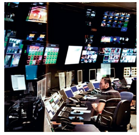
Sony Selects Belden to Meet SKY Italia's HD Needs