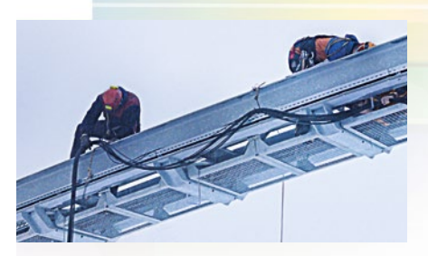
014 World Junior Alpine Skiing Championships