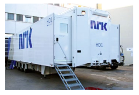
Belden Speeds Norwegian Broadcasting Corporation's Upgrade to HD

When Belden BNC High-Definition Broadcast Brilliance® Connectors are used in conjunction with Belden Professional Video Cables in fixed installations by an approved and certified Belden partner, Belden guarantees that these products will be free from manufacturing and/or material defects during the useable life (maximum 25 years) of the installation.